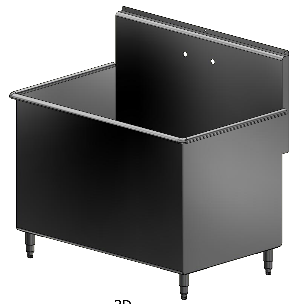
3D SCALE 1 / 12